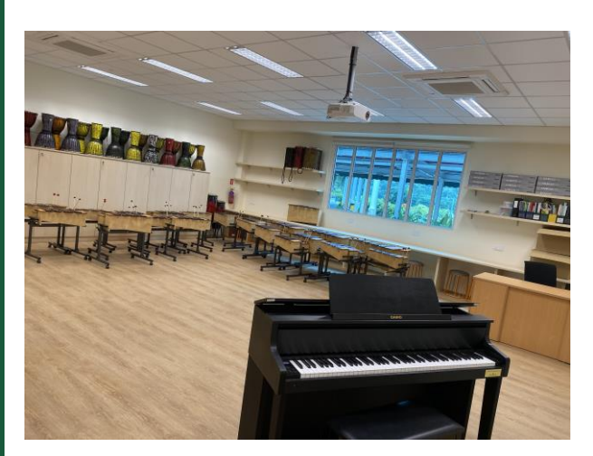
Music Room 1