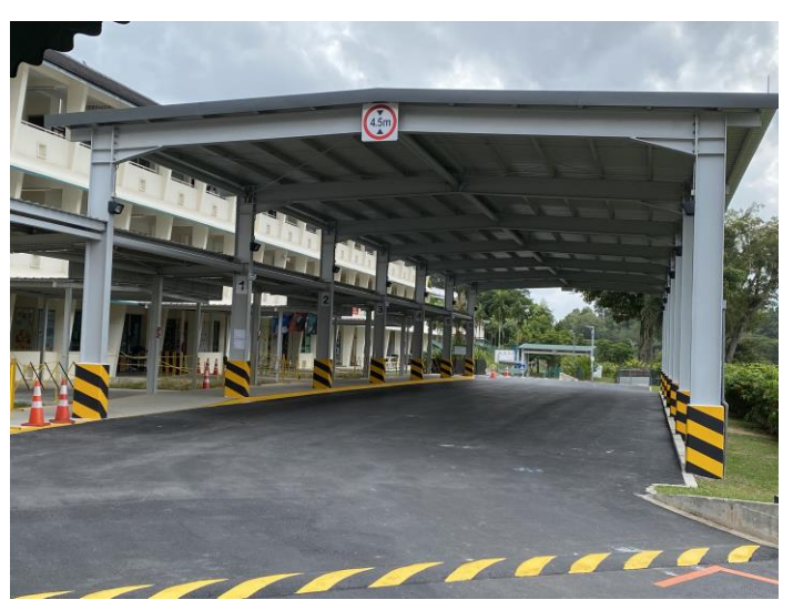
Front of Gabriel Block