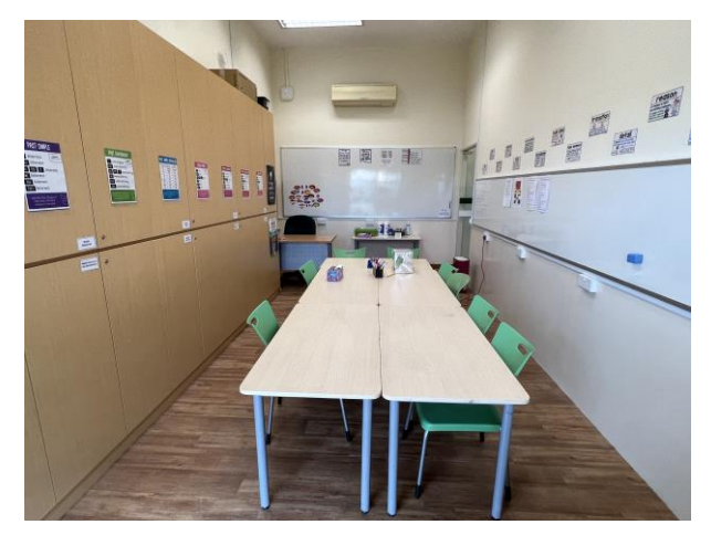
Learning Support Classroom