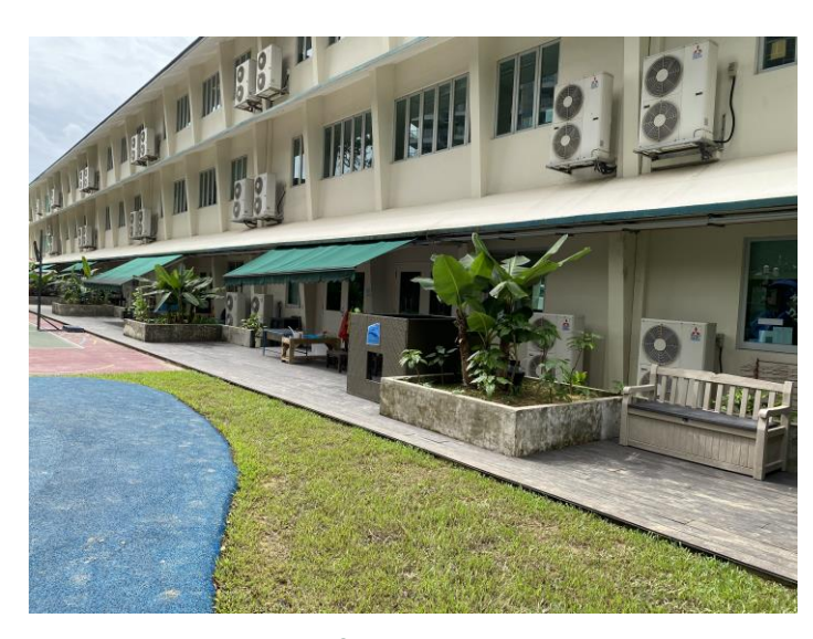
Back of Raphael Block