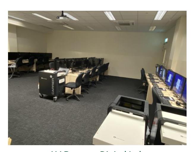
AV Room – Digital Lab