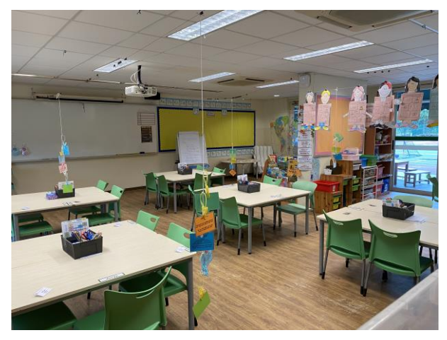
Raphael Block Classroom