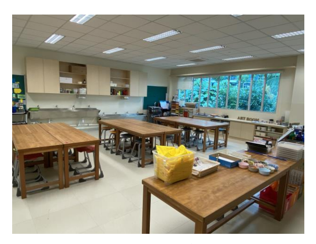
Art Room 2