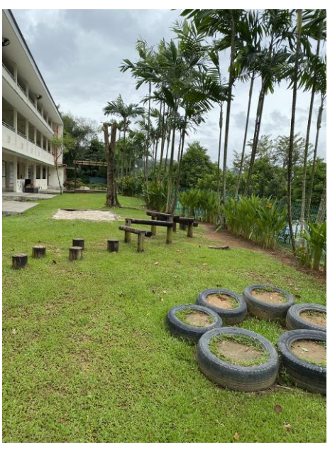
Front of Raphael Block