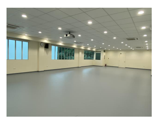
Multi Purpose Hall