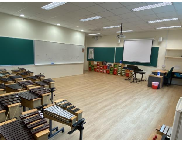
Music Room 2